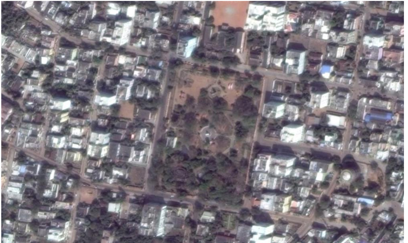
Location Map of Gandhinagar Park